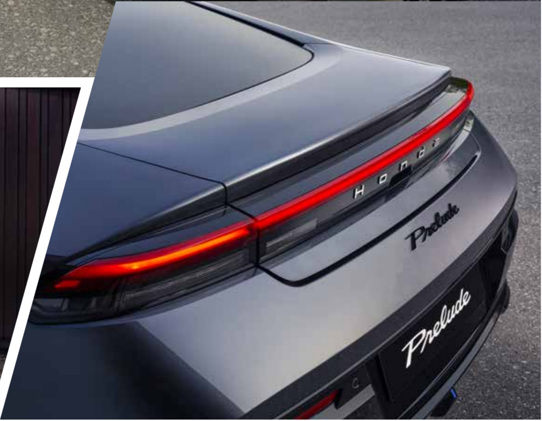
△ SLEEK, FAST-BACK PROFILE