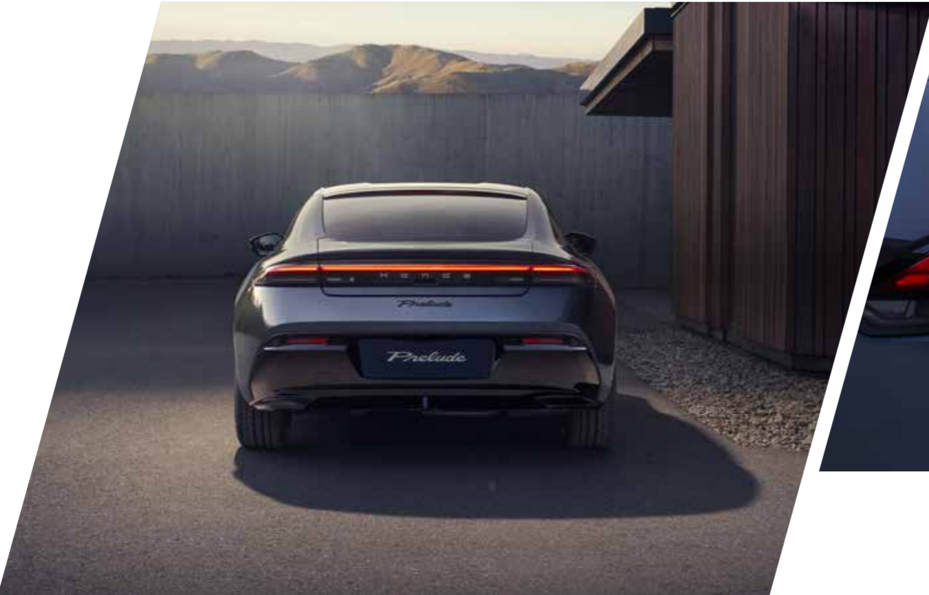
▶ LOW SPORTY/ COUPE STANCE