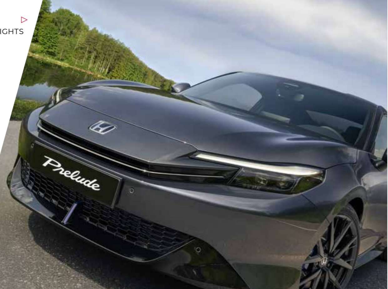
▶ LED HEADLIGHTS