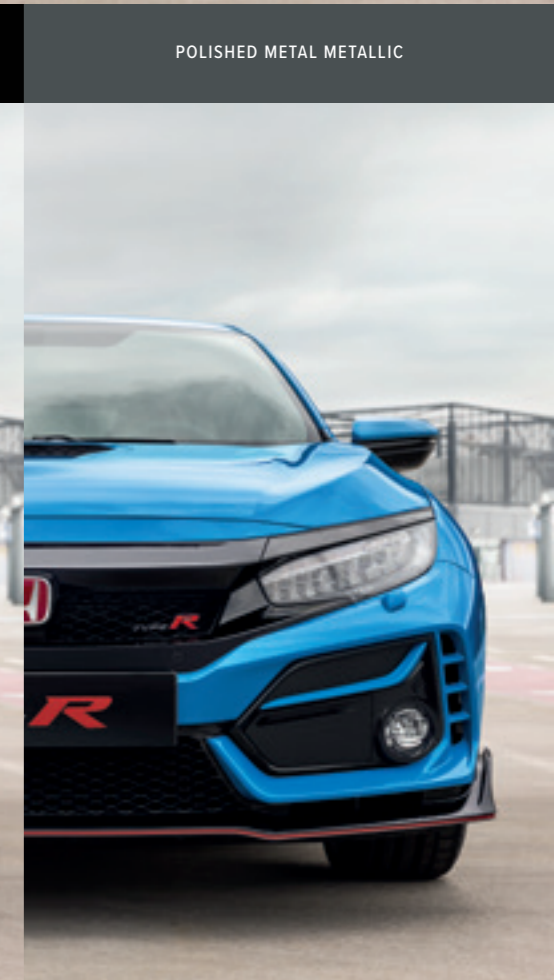
RACING BLUE PEARL