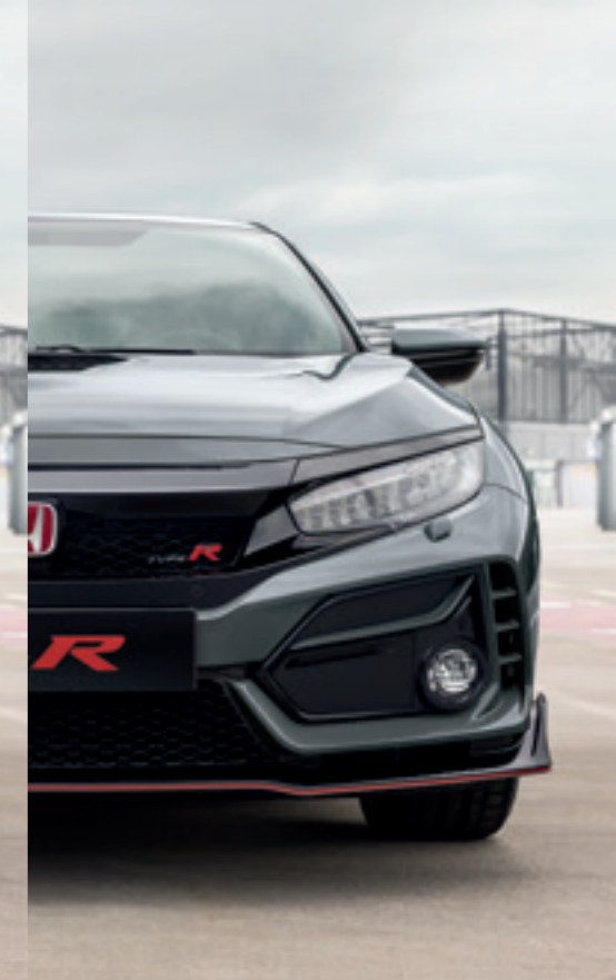
POLISHED METAL METALLIC