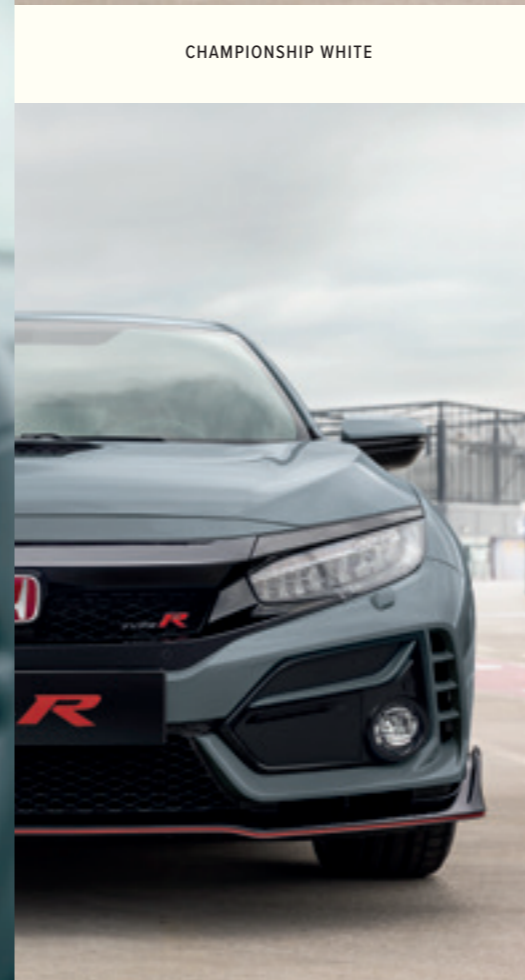
SONIC GREY PEARL