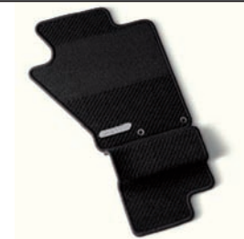
9 > Premium floor carpets - Graphite Black