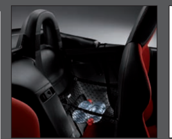
12 > Seat back net