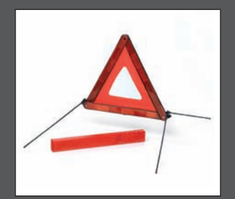
15 > Warning triangle