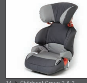
14 > Childseat Group 2 & 3