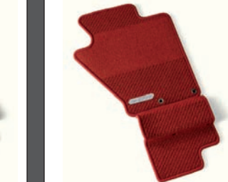
10 > Premium floor carpets - Premium Red