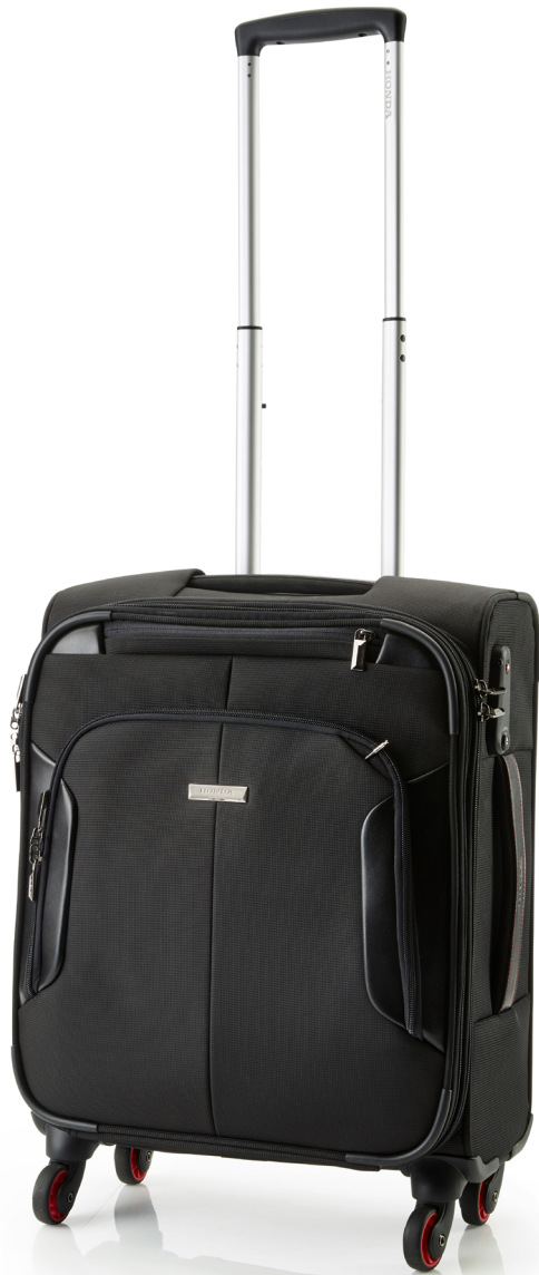
HONDA SAMSONITE TROLLEY CABIN SIZE TROLLEY. DIMENSIONS: 55CM X 41.5CM X 26.5CM, CONTENT: 34L, WEIGHT: 31KG