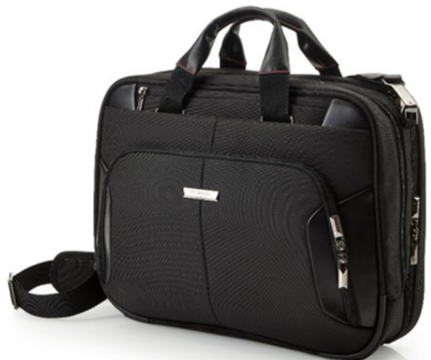
HONDA SAMSONITE LAPTOP BAG BRIEFCASE MODEL. DIMENSIONS: 34CM X 44.5CM X 24.5CM, EXPANDED DI- MENSIONS: 34CM X 44.5CM X 31CM, CONTENT: 24L/32L, MAXIMUM LAPTOP DIMENSIONS 27CM X 37CM X 4CM (Ø 39.6CM OR 15.6"), WEIGHT: 1.6KG